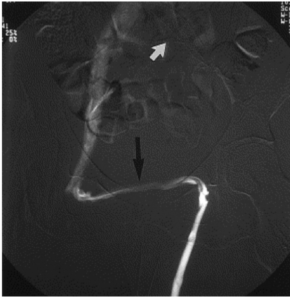
Fig 1. Venograms showing patent left to right cross-femoral saphenous vein graft 6 months after Palma procedure. From Jost CJ, Gloviczki P, Cherry KJ, McKusick MA, Harmsen WS, Jenkins GD, Bower TC. Surgical reconstructions of iliofemoral veins and the inferior vena cava for nonmalignant occlusive disease. J Vasc Surg 2001;33:320-8, with permission. 109

solution and tunneled to the contralateral groin in a suprapubic, subcutaneous position, where it is anastomosed to the common femoral vein. Excision of intraluminal post-thrombotic fibrous bands following femoral venotomy (endophlebectomy) may be needed. When suitable autologous conduit is not available, an 8 or 10-mm, externally supported expanded polytetrafluoroethylene (ePTFE) graft is the best alternative. A temporary arteriovenous fistula can be placed to improve flow and to aid patency. A large tributary of the ipsilateral great saphenous vein or the transected great saphenous vein can be anastomosed in an end-to-side fashion to the proximal superficial femoral artery. In patients with vein graft, this fistula is taken down at 3 months. In those with ePTFE grafts, the fistula should be left as long as possible in an asymptomatic patient.