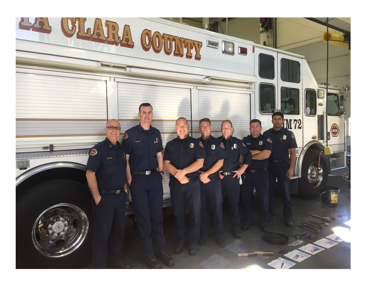
County Fire's HazMat, A-shift crew