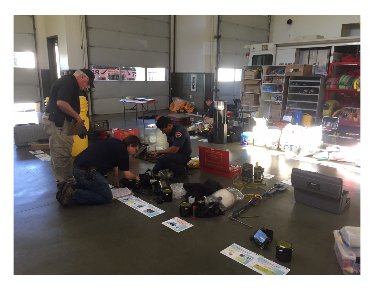
Representatives from CalOES inspect HazMat 72's equipment.