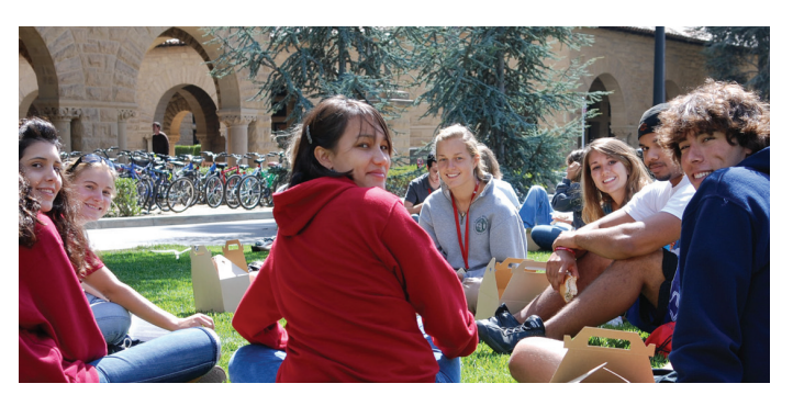
GRADUATE LIFE OFFICE

Stanford phone, dial the last five digits of the phone number. For off-campus calls, dial 9 and then the phone number. 911 Emergency Calls also require you to dial 9 - dial 9-911. Phone and network service are included in the technology fee charged to your university bill. To learn more, visit http://studentphone.stanford.edu. If you need further assistance, please call 725-HELP (725-4357).