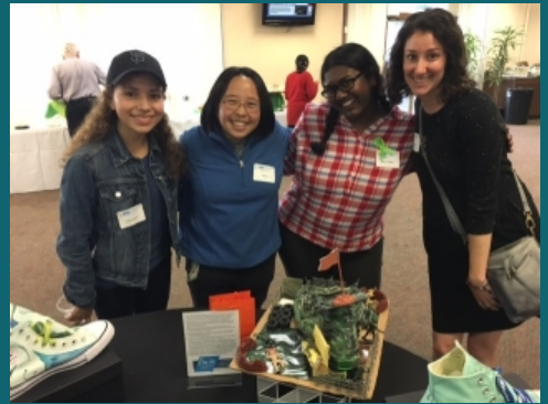
Some of our youth partners and staff celebrated NAMI Santa Clara County's 40th anniversary in April.